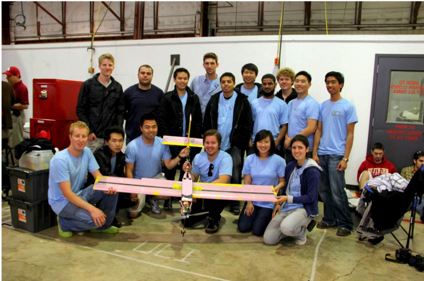
Second Place Winner: University of California at Irvine: Angel of Attack.